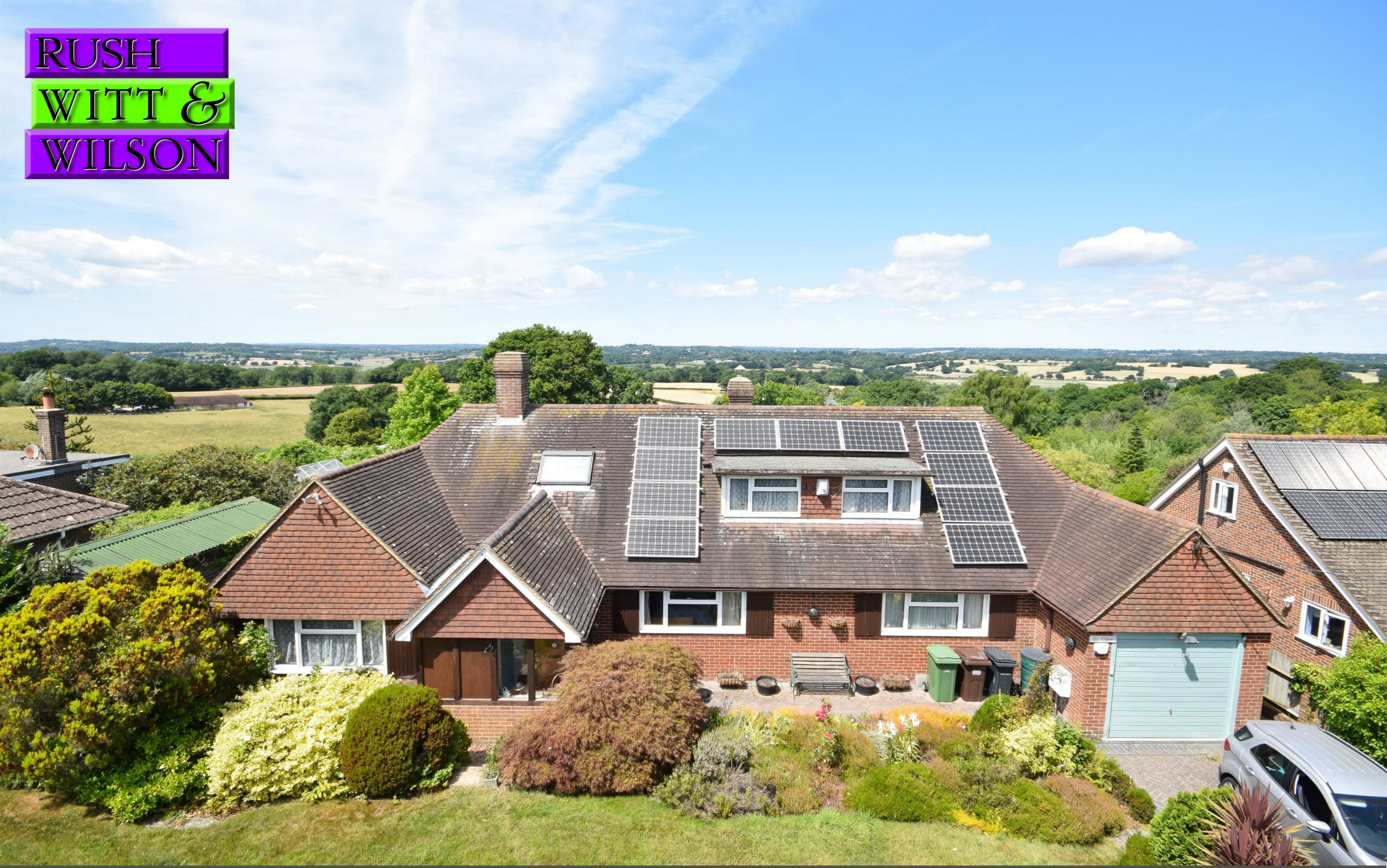
St Giles, Dixter Lane, Northiam, East Sussex, TN31 6PP. £825,000 Guide Price.